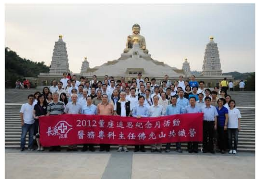
Grand Photo Terrace